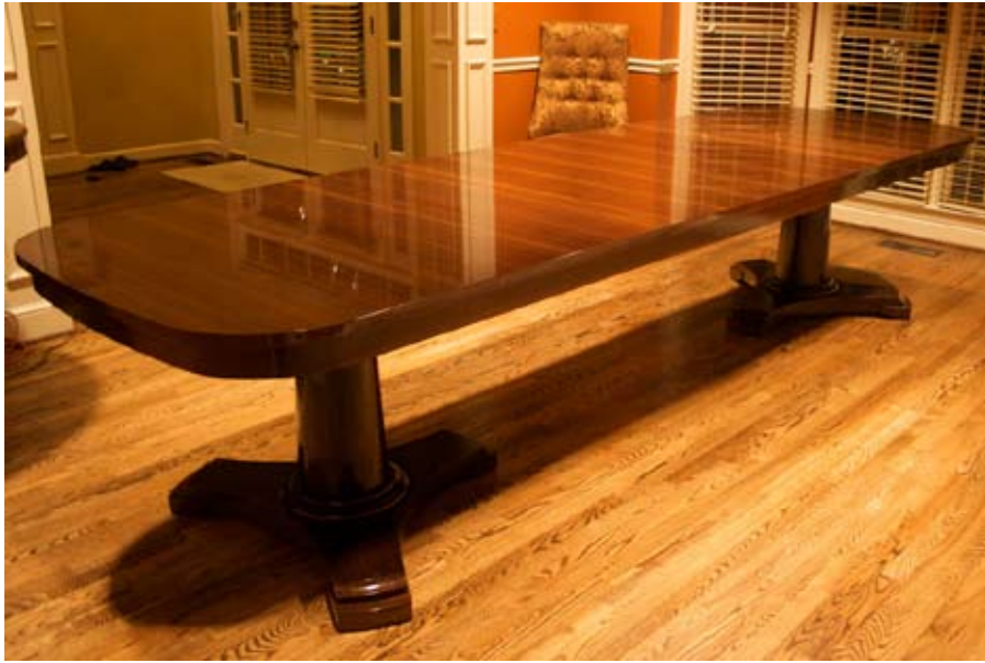
Wenge Dining Table by Chris Barber